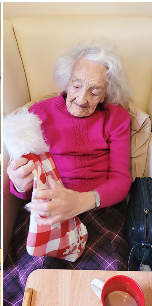
Christmas stockings from Santa